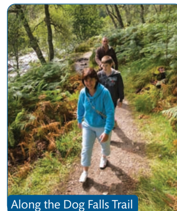
Along the Dog Falls Trail