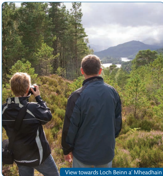
View towards Loch Beinn a' Mheadhain

Look over the islands of Loch Beinn a' Mheadhain - (middle hill - say ben-a-vey-un ) - and up into the pinewoods. Grazing animals have been well managed to allow young trees to grow. Below you, hardly noticeable, is the dam holding back the waters that feed Fasnakyle power station.