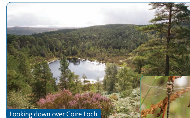
Looking down over Coire Loch